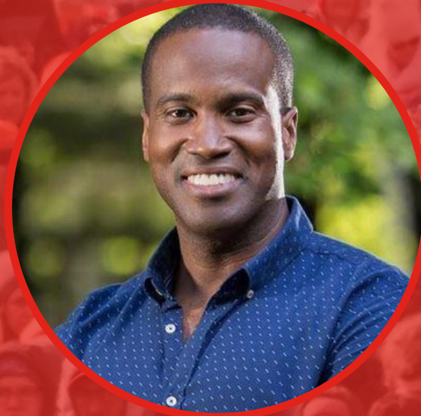
Republican John James